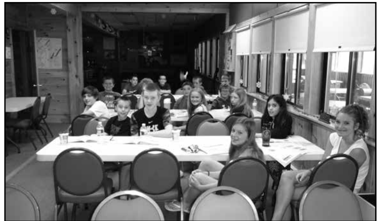
Boat Safety Class - 2015

Remember to carry your boat registration and your boating license (if required). Note that the maximum speed limit on Loon Lake is 45 mph, however it is 5 mph for PWC's within 200' of the shoreline and 5 mph for all other watercraft within 100' of the shoreline.