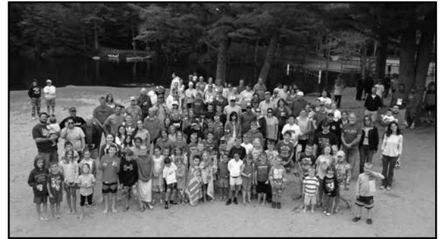
Fishing Derby - 2015

Japanese Knotweed is a fast-growing, herbaceous perennial with jointed, hollow stems and alternate, leathery leaves that are broadly ovate. White flowers bloom in August, and dormant reddish stems are visible in winter. Its early spring emergence and dense growth enables it to take over large areas with roots that can extend through soils 60 feet or more. Knotweed is very difficult to control and it is recommended that a licensed applicator assist in removing it. Digging and pulling does not solve the problem.