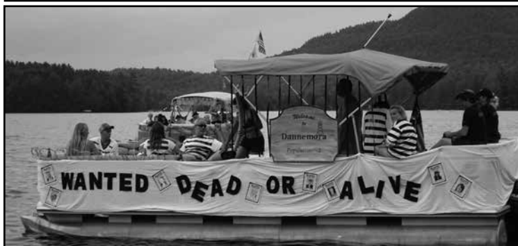
Boat Parade - 2015