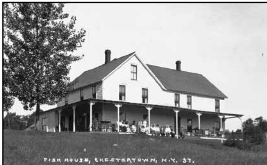
FISH HOUSE, CHESTERTOWN, N.Y. 37.