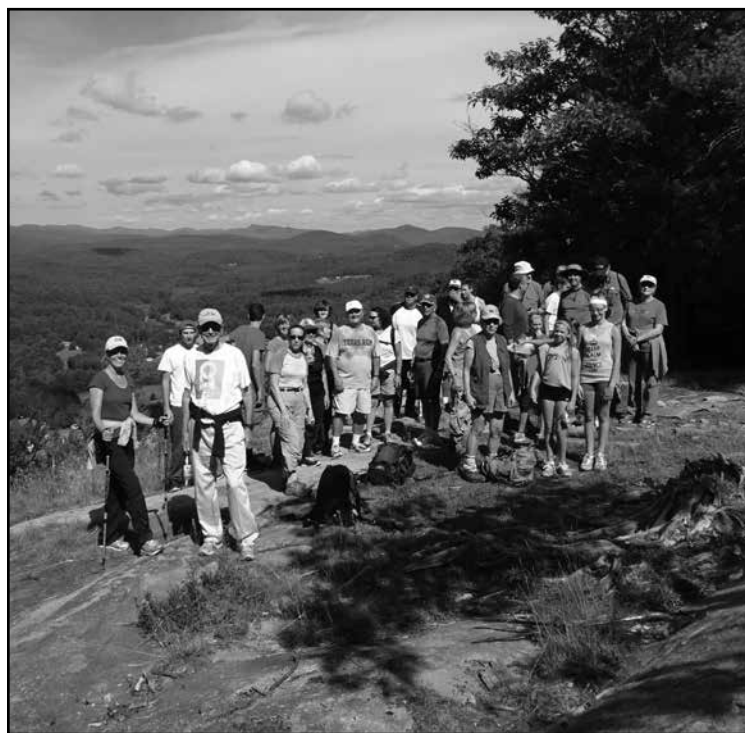
Family Day Hike - 2015

Upon the completion of six trails, a certificate and attractive pin are awarded. Go on-line to The Chester Challenge for more detailed information and brochures are available at the North Warren Chamber of Commerce. Have fun!