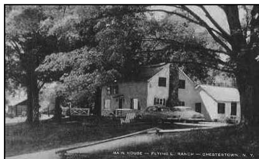
MAH HOUSE - FLYING L. RANCH - CHESTERTOWN, N. Y.