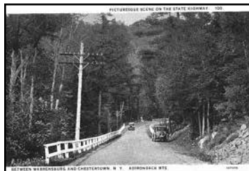
ADIRONDACK MOUNTAINS ON THE STATE HIGHWAY. 100