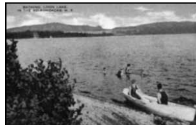
ADIRONDACK MOUNTAINS IN THE DISTANCE, N. Y.