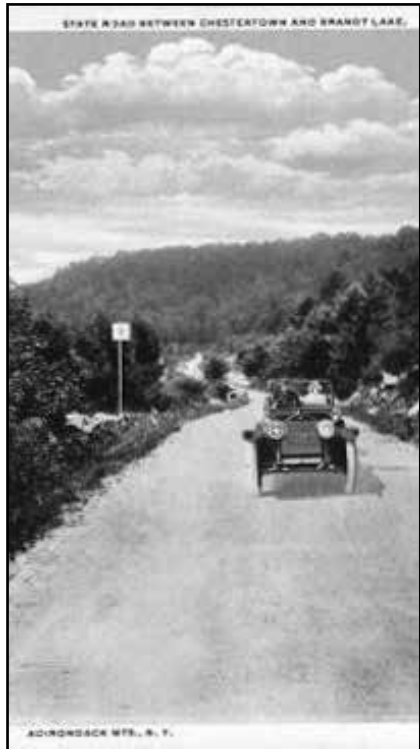
STATE ROAD BETWEEN CHESTERTOWN AND BRANDY LAKE.