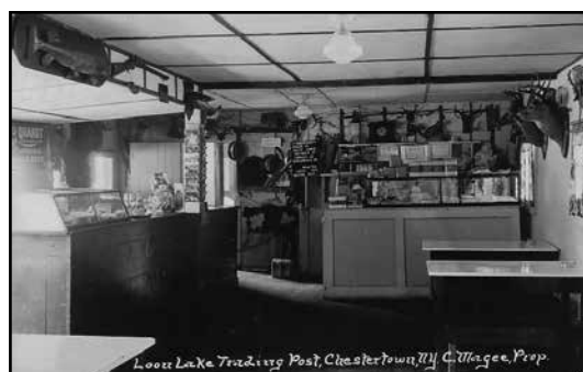
Loon Lake Trading Post, Chestertown, NY C. McGeer, Prop.