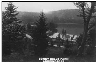
SONNY BELLE FARM ADIRONDACKS