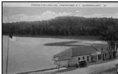
PIERSON'S ON LOON LAKE, CHESTERTOWN, N. Y. ADIRONDACK MTS. 60