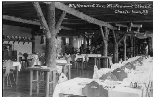
BlytheWood Inn, BlytheWood Island, Chestertown, NY