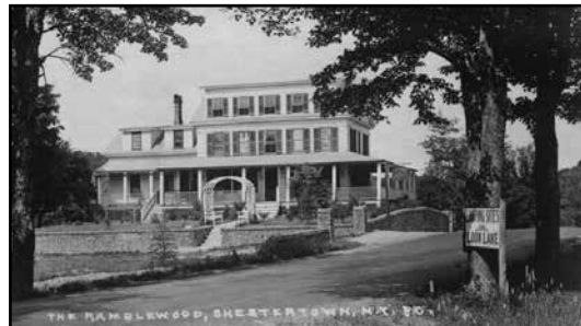
THE HAMBLEWOOD, CHESTERTOWN, N.Y. 30.